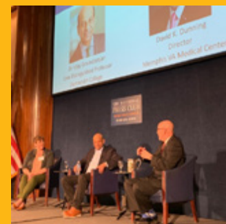
The Three Box Solution Keynote Address at the VHA Innovation Experience