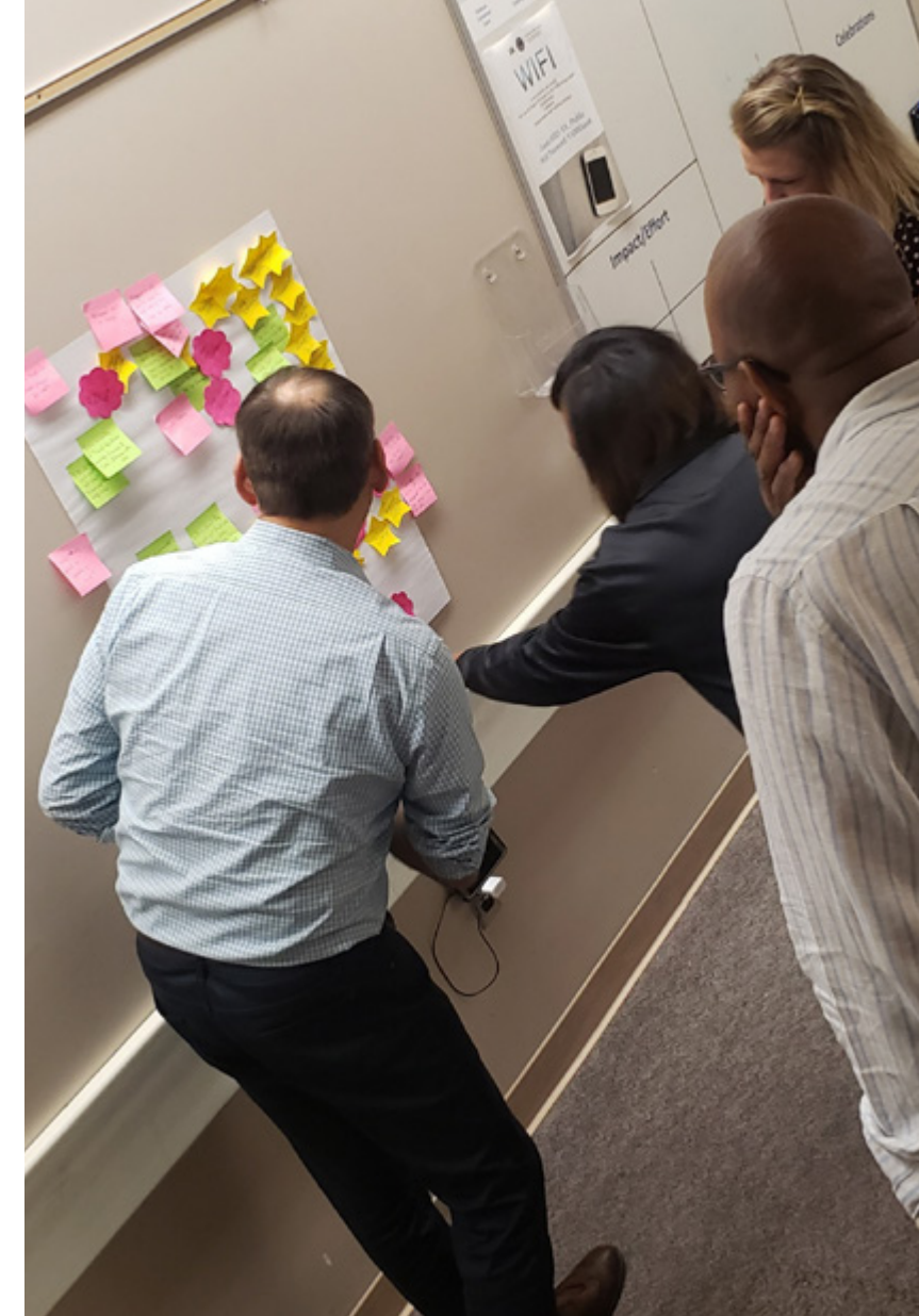
Participants at an HCD training

“Amanda and I were delighted to work with the more than 85 LVA 2019 program participants. We provided a two-day training, spread out over several sessions, to help the