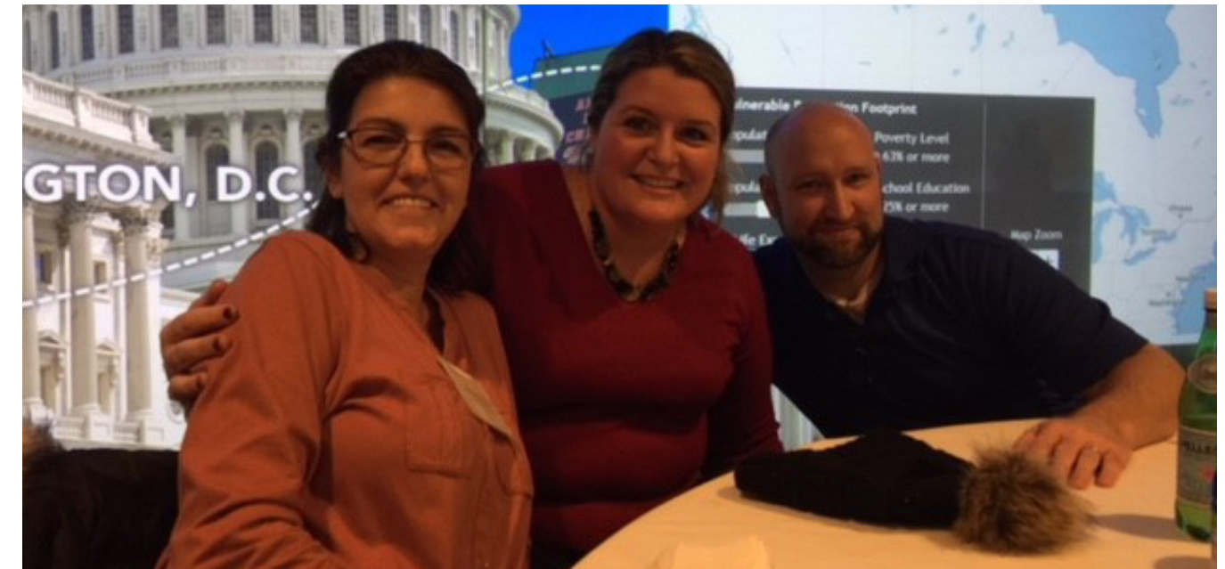
Attendees at the FY19 Innovation Accelerator Bootcamp